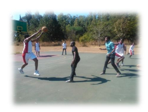
.....Down and out