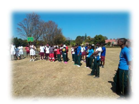
......Waiting for the games to begin

The Phoenix Omega Leos in collaboration with St Johns High Leos hosted the first District President's basketball Tournament which was a success. St John's High won the shield after battling it out with Harare The Phoenix Omegaz. All games were free and Fare!!