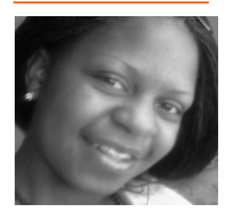
18 years old. Was born on the 21st of July. Lives in

Marondera. Learns at Watershed College. Enjoys spending time with people,